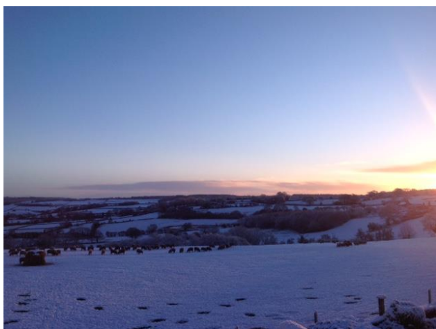
Our view with snow