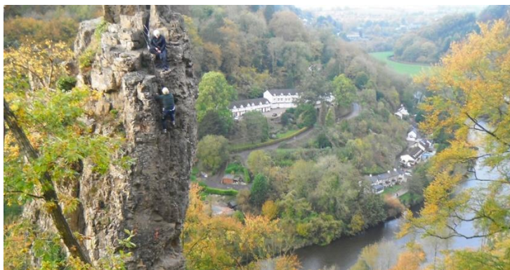
Climbing at Symonds Yat

Make the most of our glorious river. You can canoe, paddleboard, take a boat tour – and the best time to go is between Easter and Summer holidays when the river is lower, the weather better and the people fewer.